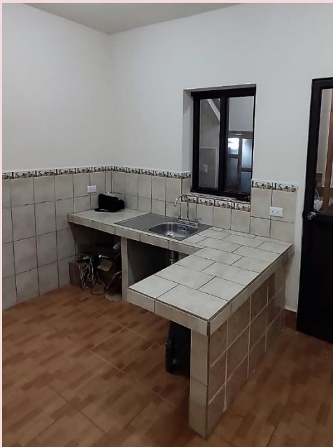
Casa Dora with inside kitchen