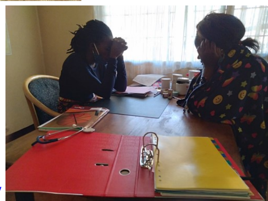
Prayer before the clinic ministry

I understand a few words, short sentences so far. I am learning, but at this point without lessons. It is a Bantu language that has