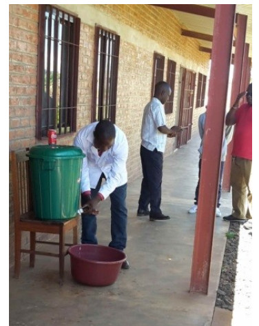
Instructions for washing hands