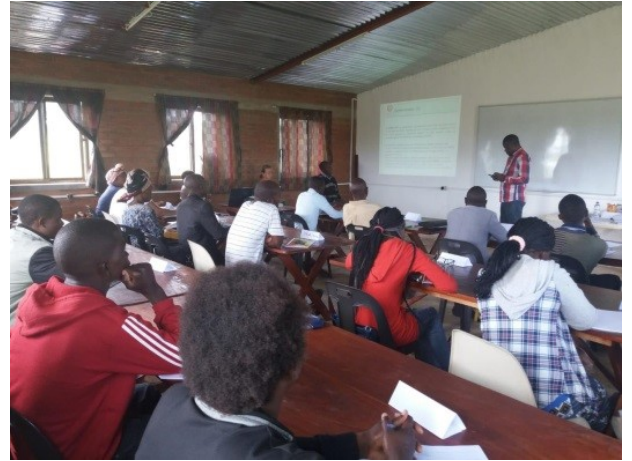
Training by doctor and administrator of the Lichinga Health Department

For this purpose, over 70 Mozambican volunteers have been trained in groups for over 2 weeks. This help centers will open as soon as Covid19 cases occur on site.