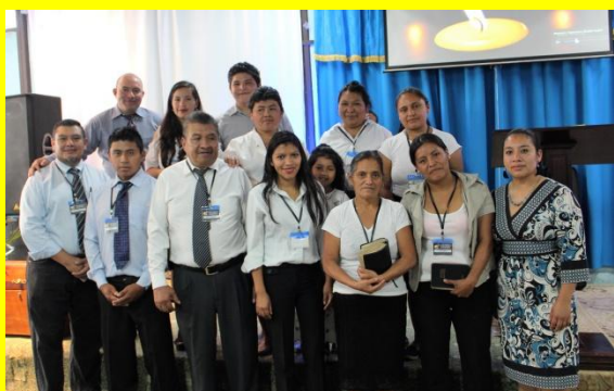
Our wonderful Team Leaders

The church is growing, and because of that we have a lot more children and teens. We now have leaders for both the children and the teens. Below are photos of them. Room has become very tight as we grow (what a wonderful problem to have!), so we are praying about raising funds to purchase the property so we can build better classrooms and a church building, and so each month a raffle will be held. We really need a miracle! Please pray that we can raise the funds quickly to purchase the land. It is not cheap!