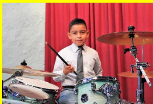
Just a young boy, but can he play!