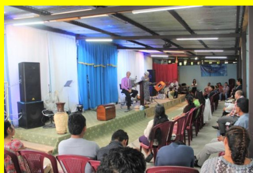
The Church Building