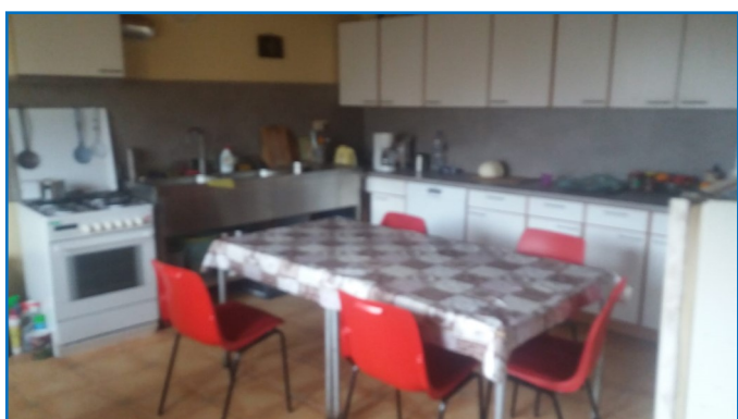
The new kitchen with big inox steel sink is very precious to me