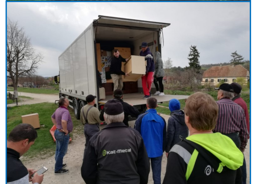
Humanitarian Aid from Finland