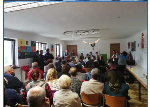
Easter service in the dining hall