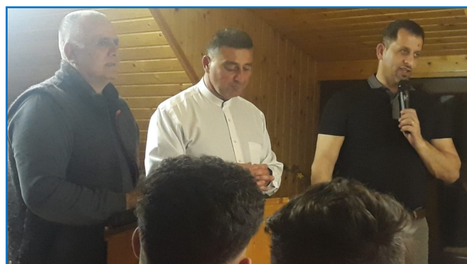
Guests from Israel at our last training

The church in Senden. They have also been coming with their Royal Ranger team to preach the gospel to our children (9-12 years) in exciting, funny ways, but also have great times where the children truly experience God. They also come with all the material for the camp, with aid for the church as well as donations for the camp.