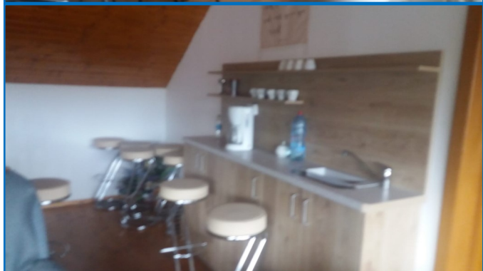
We needed a minibar upstairs in our coffee area for trainings

We will have a Teen camp in August, where some will be trained to help with the Kids Camp. (That means we will have two camps for our church this summer).