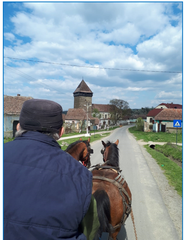
Our favorite occupation for our spare time

Globe Mission Güterstr. 37 46499 Hamminkeln