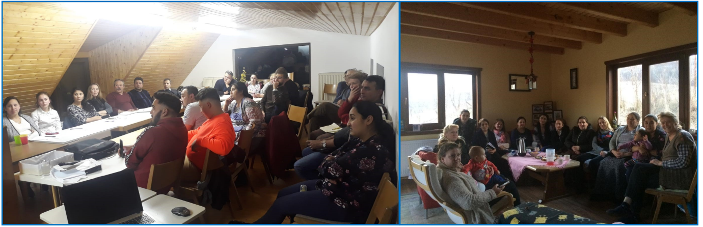
Lady's group at our last training. One afternoon for fellowship in small groups.