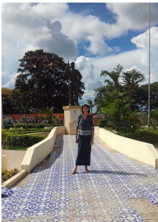
On a Square in Lichinga in March 2018