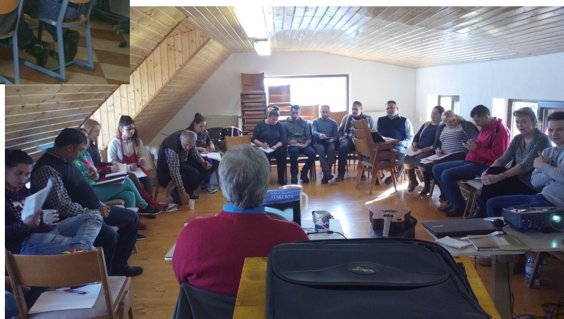
During the seminar