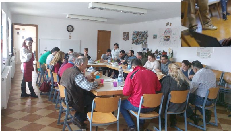
At Dinner Time