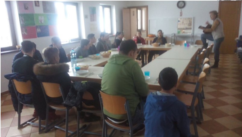
Meditation with the teenagers

to the Gospel of John. After some winter trips - skating or sledging, the girls came back, too. Meanwhile we have teenagers - as if by a miracle - in the church service again and also in the afternoons for teenage clubs (around 20 people). Praise God - He does his work! We still need your prayers!