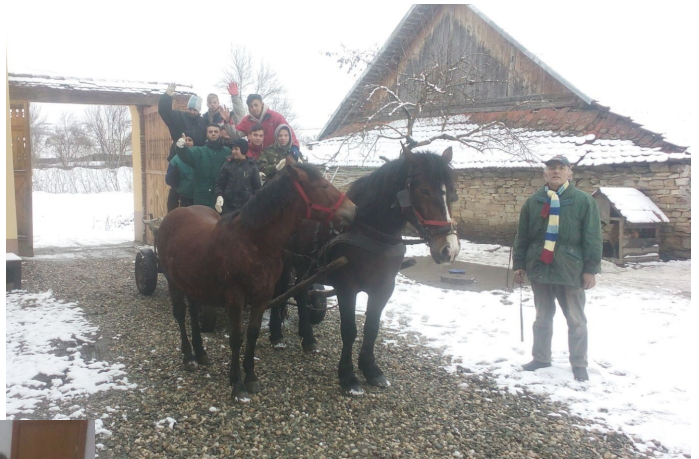
Our teenagers at our place in the weekend

In the winter some boys came over and asked if they could spend a few days with us during the holidays. They love to use the horse cart to bring the manure to the fields as fertilizer and to fetch wood from the forest, and to chop and stack it. So they came on the weekends after the holidays - sometimes even 6-7 boys. I (Michael) used the time and read the Bible with them in the mornings. It was really fun. We went through the whole proverbs of Solomon and then