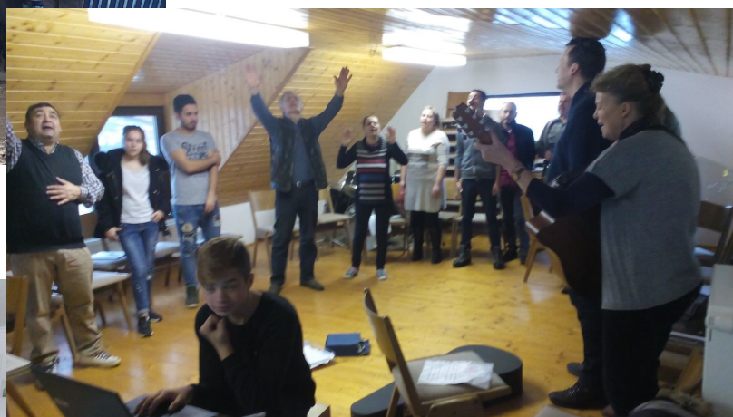
Singing and praising God