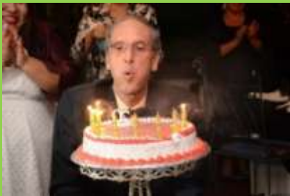
Blowing out the BVB Candles.