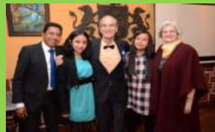
Ciudad Vieja family