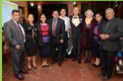
The Quiche family.