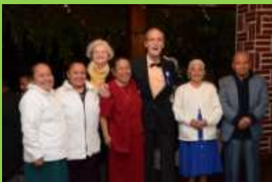
Spanish teacher family