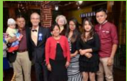
The Jocotenango family