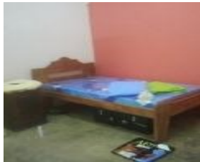
Bed from the market for €30

You can hear the Imam calling from the mosque close by, even at 4am, in addition “music” from a disco close by on the weekends... I sometimes even hear a catholic church not far from my house. I am always looking forward to my trips to the countryside, about 40 minutes away, where I just feel better and free!