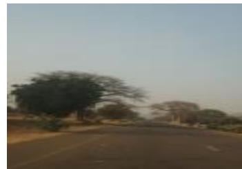
Baobab trees , often thousands of years old.