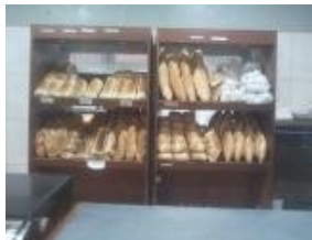
Bakery with good selection!

other prepared food is expensive, starting at €2-3, the local market is much cheaper and you can buy many different kinds of vegetables. Basic food for the locals is getting more and more expensive, so far salaries have not been adapted to the prices. All are hoping for rain and a good harvest for this year, because “El Nino” has brought much destruction through droughts in the south of the country.